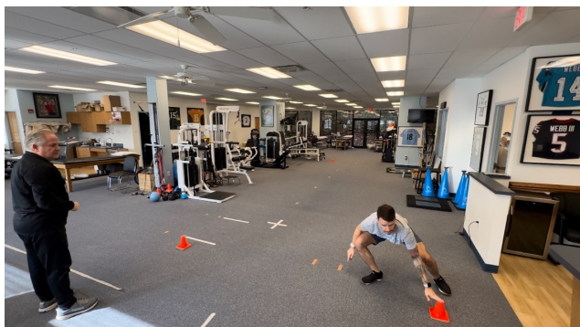
Figure 8. Reactive 10-yard T Shuttle Run Test with Verbal Command.

Blaze Pod – (Blaze Pod, San Diego, CA) ; Quickboard – (Quickboard, Memphis, TN) ; Trazer – (Trazer, Westlake, OH)