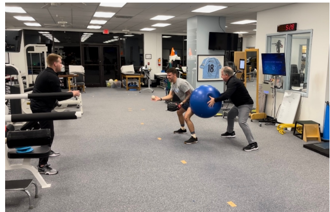
Figure 3. Lateral slide test with numbered tape on the floor + perturbations.

Differences have also been described when comparing preplanned versus reactive agility or change of directions