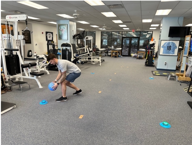
Figure 4. Four corner target light test (Blaze Pod, San Diego, CA).