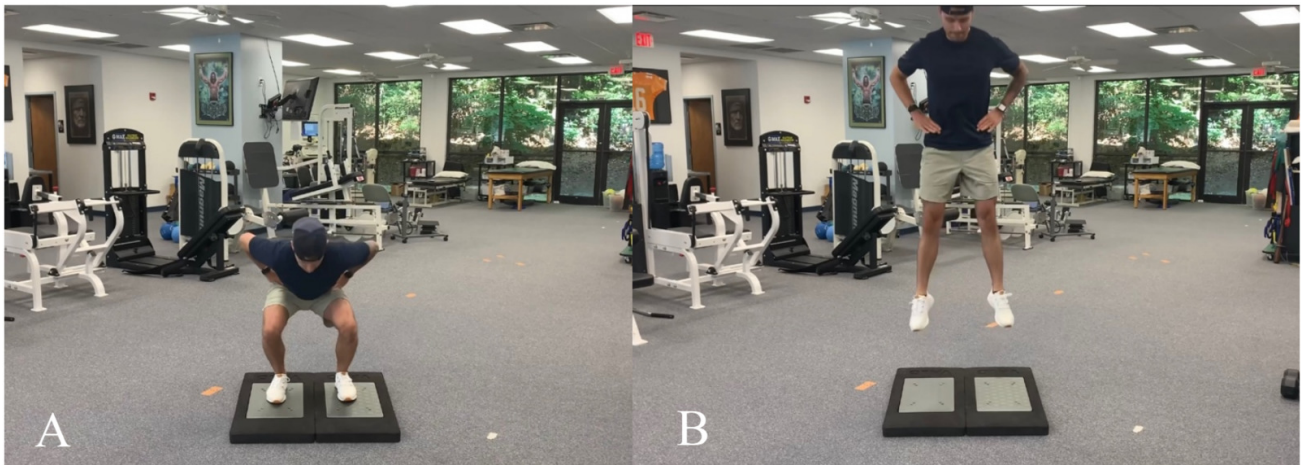
Figure 10. Countermovement jump assessment with Force Plates (Vald Performance, Australia).

Analyzing symmetry bilaterally as well as concentric and eccentric forces compared to the uninvolved side.