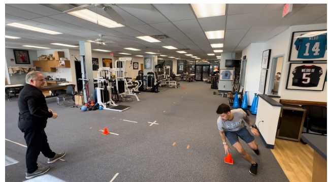
Figure 9. Reactive 10-yard L Run Test with Verbal Command.

This test involves a 10-yard run then a side shuffle to one direction for 5 yards and then in opposite direction for 5 yards and then turn and run back to start line.