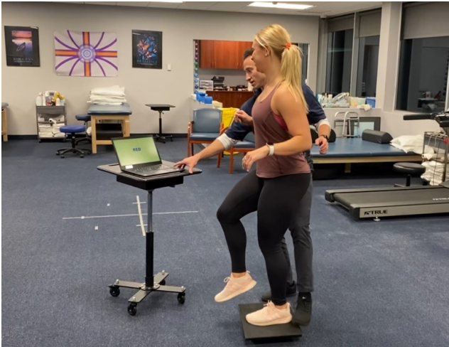
Figure 2. (See Supplemental Video 1) Single leg balance on rocker board + external focus of demand/selective attention via stroop test (athlete is instructed to recite either the color of the slide, the word itself (a specific color) or the color of the word on the slide.

informed by the athlete's ability to tolerate the functional progression without an increase in pain and swelling, while demonstrating good hip and knee control.