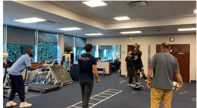
Figure 6. (See Supplemental Video 3) Single Leg Rocker Board balance with perturbations + dual tasking with multiple weighted balls + tennis ball catches.

Even following return to sport, research has demonstrated the importance of continuing a risk reduction program both in the preseason and throughout the season to help minimize the risk of reinjury. These preventative programs (Sportsmetrics Program, FIFA 11, FIFA 11+, and