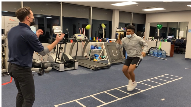
Figure 11. (See Supplemental Video 5) Reactive agility ladders + dual tasking and external focus of demand/selective attention via verbal commands and tennis ball toss.

Analyzing symmetry bilaterally as well as concentric and eccentric forces compared to the uninvolved side.