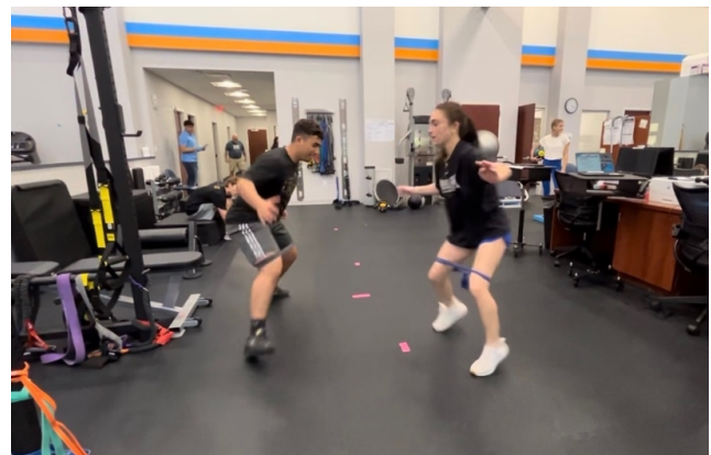
Figure 7. (See Supplemental Video 4) Reactive mirror drill with lateral slides.

Athlete is instructed to catch the tennis ball in a specific hand based on verbal command.