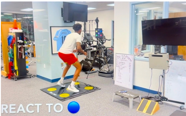
Figure 5. (See Supplemental Video 2) Neurocognitive Training - Array Reactive Foot Fire to Target Color (QuickBoard, Memphis, TN)

This is a 20 sec drill in which the athlete is instructed to tap the target color as many times as possible while continuing rapid feet throughout the drill.