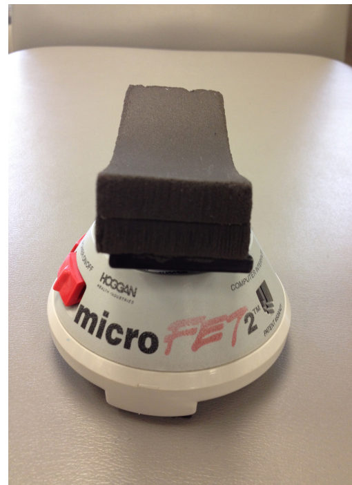
Figure 4: Hand held dynamometer used for strength measures .

the 16-18-year-old group versus the 6-10 -year-old group ( Table 4 ). Additionally, in a study considering the influence of age and skeletal maturity on shoulder ROM in healthy aged baseball players aged 8-28, Levine et al 41 found ER, IR and TROM of D arm to peak in quantity in the 13-14 year group, who were considered to be at a point of maximal growth during skeletal immaturity, versus both the 8-12 and 15-28 age groups. With such ROM measures consistently changing as a youth baseball player matures, the influence of bony and/or soft-tissue structures on shoulder ROM is important to consider.