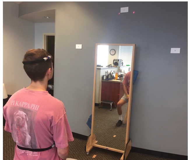
Figure 2: Performance of neuromotor training using laser harness.

At the beginning of each session, the subject was reassessed subjectively regarding symptom resolution and objectively via cervical AROM, joint mobility of all cervical levels, median nerve tension, and VOR sensitivity. There was a steady improvement in his condition throughout the plan of care. By session 4, the subject's radicular symptoms and neck pain had resolved. His lightheadedness, dizziness, visual disturbances, and headaches were reported to have decreased in frequency but were dependent on prolonged activity. At the time of discharge, all of the subject's symptoms had completely resolved except for his headaches,