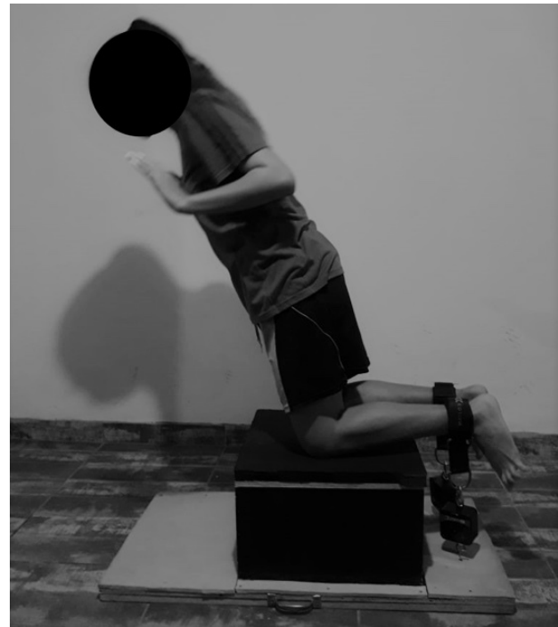
Figure 1: Assessment of eccentric knee flexor strength during the NHE execution.

Briefly, the participant was positioned to perform the NHE on a platform, and commercially available load cells (E-lastic; E-sporte Soluções Esportivas, Brasília, Brazil) with simultaneous transference of data via Bluetooth were