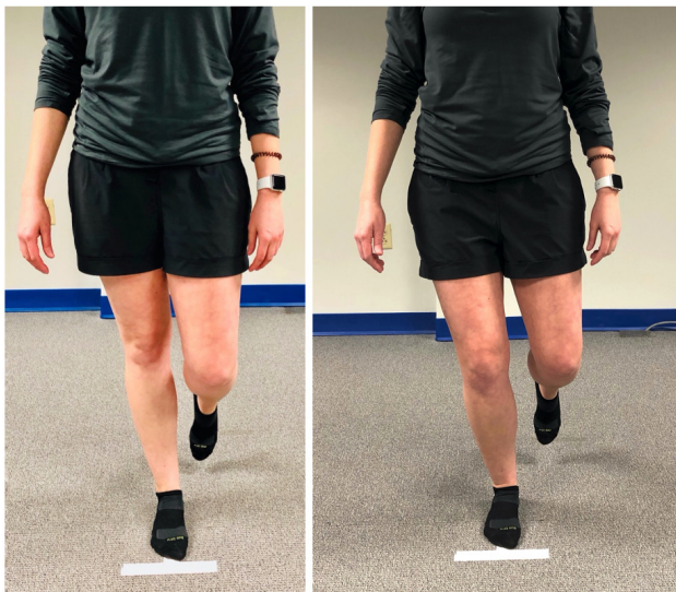
Figure 3A-B: Performance of the clinical single leg squat test (SLST) protocol. A. Starting position. B. Squat position.

equipment or time-consuming set-up and visual assessment of subject performance has been shown to be reliable. 20 To perform the SLST, a “T” (6" horizontal, 10" vertical) is taped on the floor using 1.5" wide athletic tape. The subject stands on the vertical tape on their barefoot test extremity and flexes the other knee to 90°. The subjects are then instructed to squat until they can no longer see the horizontal tape in front of their toes and then return to the starting position. (Figure 3A-B) Subjects were permitted to practice the SLST protocol until they felt comfortable with the instructions.