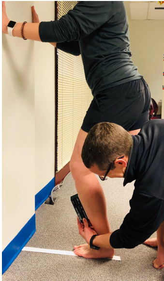
Figure 4C: Measurement of ankle dorsiflexion using the weight-bearing lunge (WBL) and a digital inclinometer.

ters in front of the subject and 0.9 meters from the floor. Videos were analyzed for group assignment by two independent physical therapists (one with 20 years of clinical experience in outpatient orthopedics and board certification in orthopedic and sports physical therapy (BK); and another with five years of clinical experience in outpatient orthopedics and board certification in orthopedic physical therapy (AD)). These researchers were blinded to subjects' other data points. Subjects whose patella deviated medial to the second toe on \geq 3 of their five squat attempts were placed in the fail group. All other subjects were placed into the pass group. Raters met to review discrepancies and together determined subjects' final group assignment so that there was complete agreement for final group assignment.