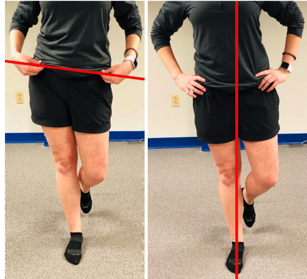
Figure 1A-B: A. Failure during single leg stance due to Trendelenburg position. B. Failure of single leg stance due to compensated Trendelenburg posture.

After this, each subject participated in a screening protocol to determine whether they had grossly sufficient balance, neuromuscular control, and hip abductor strength to perform the SLST. The screening protocol consisted of three tasks: (1) 30 seconds of single leg stance on the test extremity; (2) five squats performed in a bilateral fashion; (3) manual muscle test of the hip abductors. During the single leg stance test, subjects’ balance and ability to maintain a level pelvis and neutral trunk were assessed so that balance and gross strength deficits of the hip abductors could be clinically ruled out as contributors to MKD on the SLST. Subjects failed this portion of the screening test if they touched the floor with the non-dominant extremity or if a Trendelenburg/compensated Trendelenburg position 49 (Figure 1A-B) was identified by the investigator (LC).