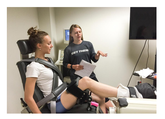
Figure 3: Biodex Measurement Set-up

sistance. The subject then performed four maximal concentric contractions plantar flexion at angular velocities of 60°, 90°, and 120°/sec with a two-minute rest period between tests to minimize fatigue. The order of velocities was randomized. The first measurement was eliminated, and the remaining three were averaged for analysis using standard Biodex software in Newton.meters (NM).<sup>32,46,49</sup> (Figure 3).