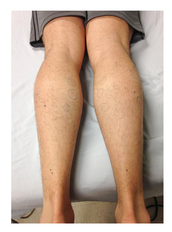
Figure 1: Trigger Points Palpated (Circled)

DN was performed using Seirin J-Type 30x30 needles. The 10cm VAS (Visual Analog Scale) was used to assess overall calf pain pre- and post- intervention as reported by participant, and temperature was measured with The Exergen TAT-2000 Series Professional Model Temporal Scanner (Exergen Corporation, Watertown, MA). A goniometer was used to measure the ankle dorsiflexion PROM in CKC