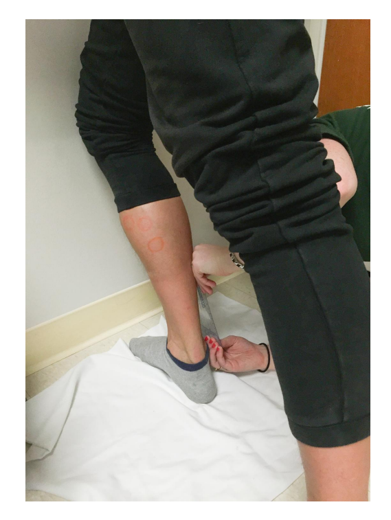
Figure 2: Measurement of Closed-chain Ankle Dorsiflexion (PROM)

Maximum muscular torque of the triceps surae was measured bilaterally using a Biodex prior to and after the DN or SHAM intervention. Two assessors blinded to group assignment performed all of these measurements. The participants were barefoot, seated and secured using a double chest strap, quadriceps strap, and two additional support straps fastened over the dorsum of the foot. The hip was placed at 90° flexion, the knee at 30° flexion, and the ankle at an angle of comfort for the participant. The axis of rotation of the Biodex ankle attachment was aligned with the lateral malleolus of the ankle being tested. Prior to testing, the participants warmed up by submaximally plantar- and dorsi-flexing each ankle ten times on the Biodex with no re-