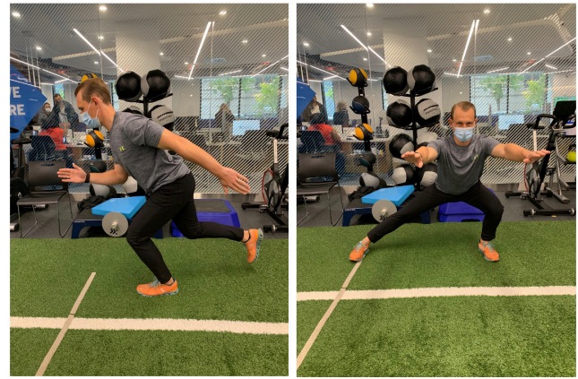
Figure 6: Proper hip hinge pattern to decrease pressure on knee joint (a) single leg RDL, (b) side lunge/Cossack squat

Continuing to develop kinetic chain linking procedures