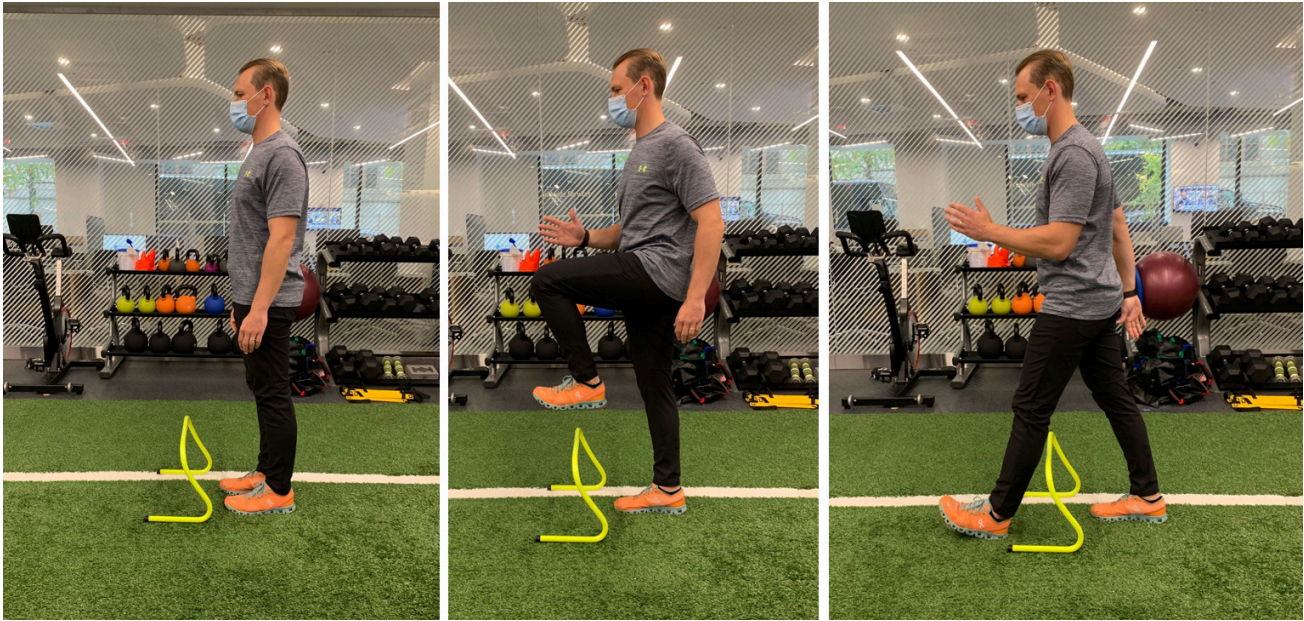
Figure 2: Single hurdle step over to aid with proper gait: (a) starting position, (b) Maximal knee flexion with opposite arm flexion, (c) ending position of heel strike and quad contraction

hab process, it is valuable for the athlete to participate in some modification of their sport to remain connected in a positive way. Having a basketball player perform seated ball handling and shooting activities or having a tennis player perform seated forehand shots can allow for a smooth transition back to in game mechanics. Initiating such activities such in this stage can help them on their mental journey of returning to sport.