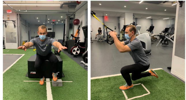
Figure 8: Single leg squat progressions (a) block underneath foot to decreased weight bearing on that side, (b) Suspension system assisted single leg squat

progressed well to this point, they should continue to monitor the overall load on their knee to prevent any persistent effusion or pain.