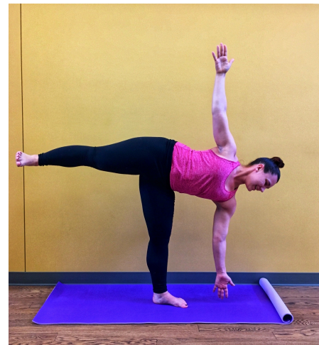
Figure 4: Half Moon Pose