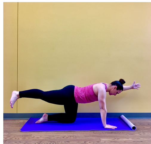
Figure 5: Bird Dog Pose

subjects. Body weight distribution differences between