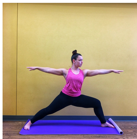
Figure 2: Warrior Two Pose

males and between subjects who had participated in yoga in