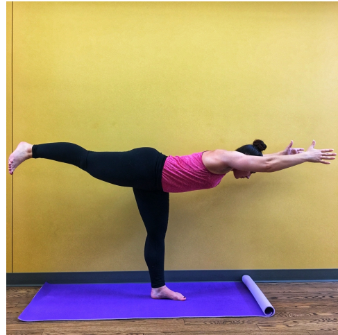
Figure 3: Warrior Three Pose

The secondary purpose of this study was to examine whether there was a significant difference between gluteus medius and gluteus maximus activation between male and female subjects and experienced and inexperienced subjects. There was not a significant difference in gluteus maximus activation between inexperienced and experienced or male and female subjects. But a significant difference in gluteus medius activation was found between male and female subjects and between experienced and inexperienced subjects. Males produced higher %MVIC of gluteus medius activity than females, and inexperienced subjects demonstrated higher gluteus medius activation than experienced