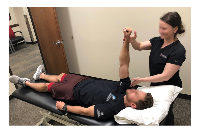
Figure 5: The "Supine Punch" Exercise with external perturbations.