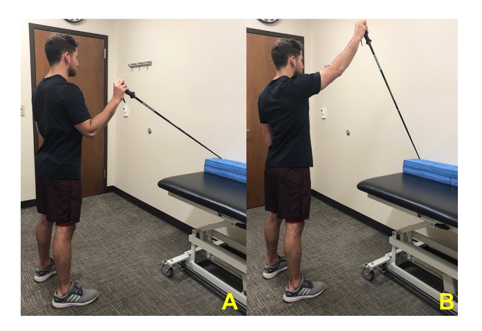
Figure 1: Active assisted forward flexion using a ski pole or dowel (A, start position and B, end position).

Activation of the infraspinatus muscle can be achieved by performing side lying external rotation ( Figure 3 ). This exercise has been shown to demonstrate the highest EMG activation for the infraspinatus and teres minor compared to other exercises.<sup>29</sup> Initial activation of the subscapularis can be achieved by performing standing internal rotation at