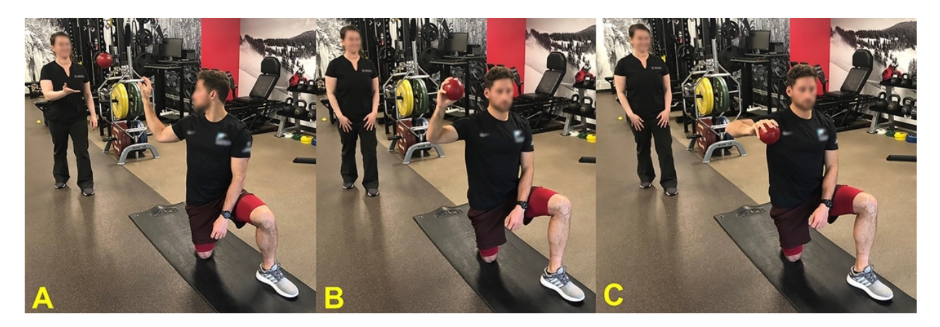
Figure 9: The Reverse Throw Progression

Completion of 60 sec 2lb med ball bounce at 165 beats per minute Complete 6lb throw >90% distance of contralateral side >21 touches in 15 seconds >90% distance of contralateral side (Normalized score)