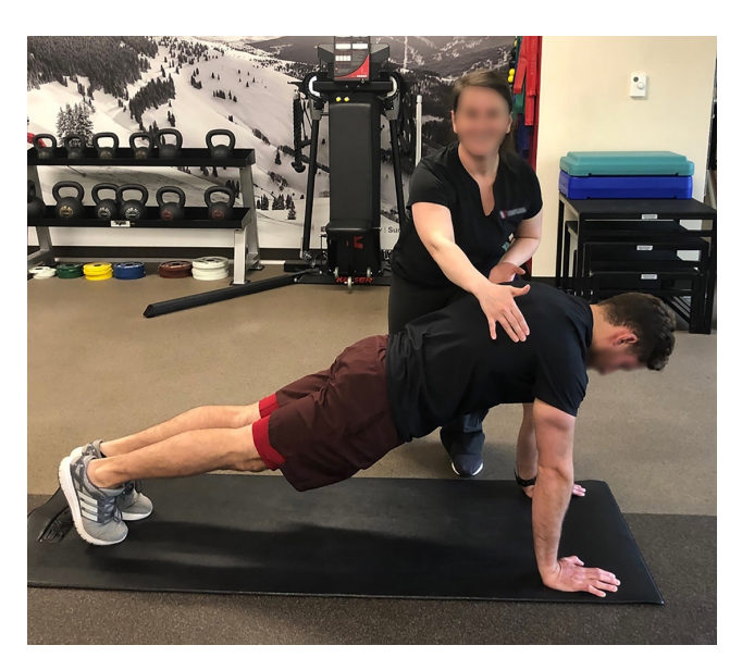
Figure 8: Push-up plus exercise with perturbations.

Once the patient has met the criteria listed in Table 4 , they can begin power exercises, which typically occurs five months post-operatively. The goal of this portion of phase IV is to further enhance dynamic stability with advanced overhead activities, while introducing explosive muscular power with sport or occupational specific movement patterns. Plyometric exercises play an important role in the progression of rehabilitation and the development of power. It has been shown that plyometric exercises lead to increased shoulder power, endurance, enhancement of joint position sense and kinesthesia, and increased throw-