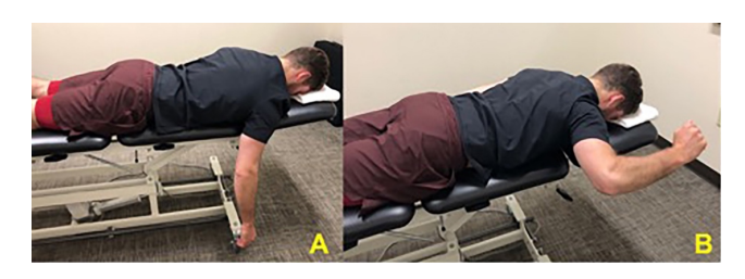
Figure 4: Prone external rotation at 90° Abduction. (A, start position and B, end position).

Initial resistance strengthening is introduced once criteria in Table 2 have been met and the patient is at least eight weeks post-operative. At this time the labrum is thought to be in the later stages of healing and can withstand preliminary loading of the tissue.<sup>26,39</sup> The goal of this phase is to further progress rotator cuff and periscapular muscular strength and establish scapulohumeral control with in-