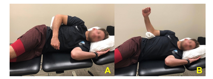
Figure 3: Side lying External Rotation. (A, start position and B, end position).

0° abduction and later progressing to 90^{\circ} .<sup>30</sup> When appropriate, the patient can progress to prone external rotation at 90^{\circ} abduction, which has been shown to demonstrate high levels of subscapularis, supraspinatus, and infraspinatus activation (Figure 4).<sup>29,31</sup>