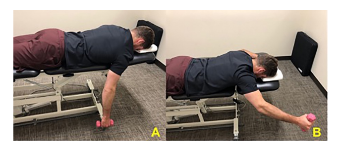
Figure 6: Prone "Full Can" Exercise. (A, start position and B, end position).

Advanced strengthening is introduced once the criteria in Table 3 have been met, which typically occurs three months post-operatively. At this point, the posterior labrum and capsule are thought to be healed and able to withstand increased load demands.<sup>26,39</sup> The goal of advanced strengthening is to continue progression of the rotator cuff and periscapular strengthening and further enhance dynamic shoulder stability while also emphasizing control with posterior loading to maximize advanced upper extremity function.