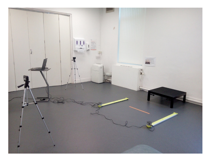
Figure 2. Equipment set-up