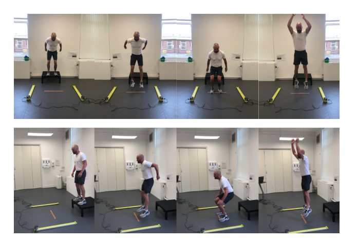
Figure 1. The LESS test protocol

The Kolmogorov-Smirnov test was used to confirm normality of the data. Significant correlations between LESS scores and lower limb performance data were tested using a Spearman's rho analysis with significance levels set a p< 0.05. Differences between excellent – good LESS scores ( \leq 5) and moderate – poor LESS scores (> 5) for all testing data were analysed using a multi-variate ANOVA with significance set at p <0.05. Effect sizes were reported as partial eta-squared ( \eta^2 ) and were interpreted using Cohen's (1992) classifications as follows; 0 – 0.1 is a small effect, 0.1-0.3 is a small to medium effect, 0.3-0.5 is a medium to large effect and 0.5 and above is a large effect.