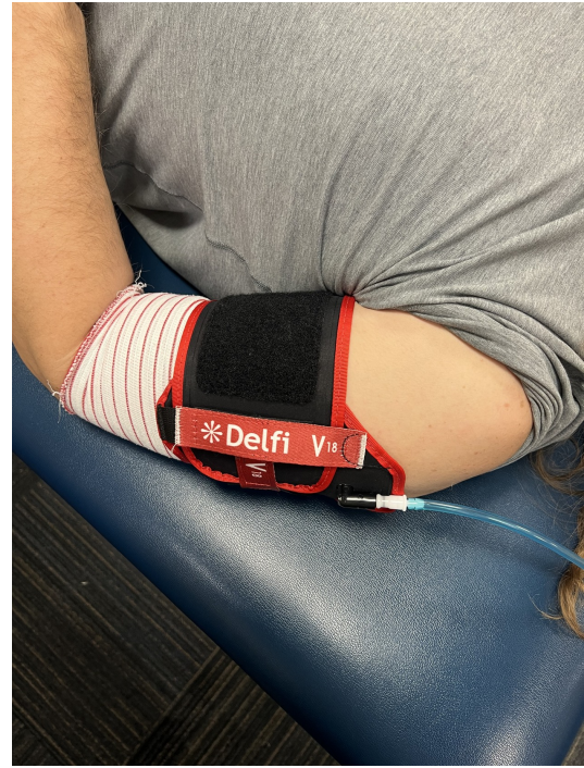
Figure 2. Delfi Personalized Tourniquet system measuring limb occlusion pressure

A variety of patient reported outcome measures were used to track changes in variables including pain, function, satisfaction, and ADL's. These outcome measures included the PENN, ASES, SANE, and PSFS (Table 2). Both subjects met all MCID's for each patient reported outcome measure, and per subject report met goals. Subject A had a change of 46, 13, 30, and 3/6/7 respectively on the patient reported outcome measures. Subject B had similar outcomes with a change of 36, 22, 15, 3/2/5 respectively on the patient reported outcome measures. Subject A reported having no