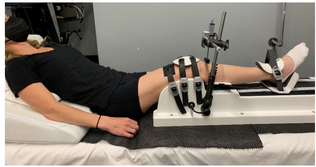
Figure 1. Patient set-up in GNRB device